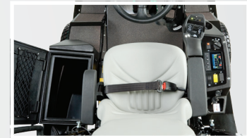
Fingertip unit, traction control & storage options