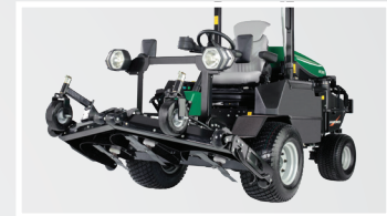
Design focused for road transport

Partnership with industry expert, Mühling. Close coupled to tractor for maximum manoeuvrability and stability in transport.