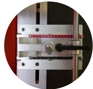
Front roller Vee brackets with new positioning scales