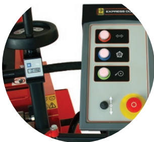
Simple controls and digital counters ensure balanced, consistent grinding