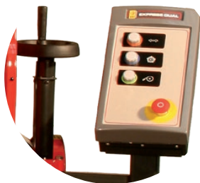
Simple controls and digital counters ensure balanced, consistent grinding