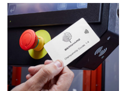
NEW RFID technology