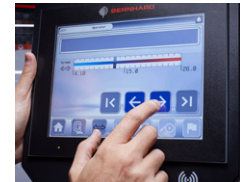
NEW 10.5" touch-screen