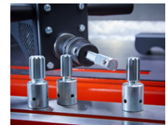
NEW Direct reel drive

The Express Dual 5500 is a truly connected reel sharpening system featuring our unique laser reel surveying system, 10.5" touch screen, contactless cards and direct reel drive.