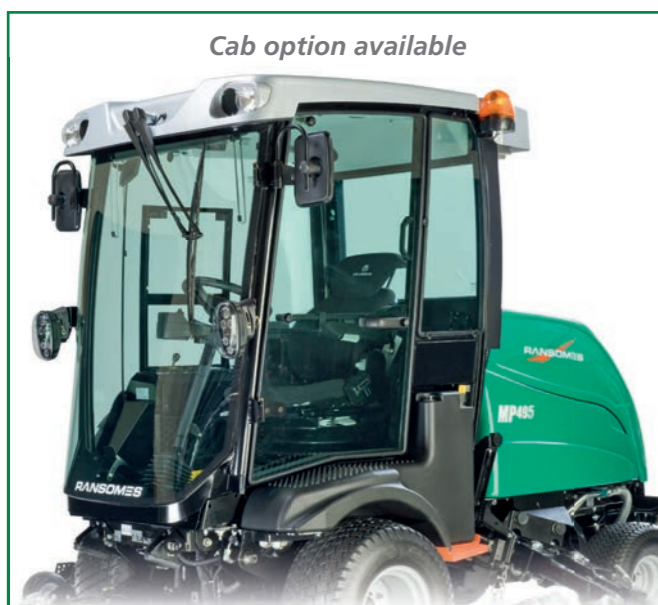
Cab option available