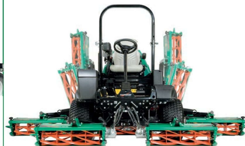
Cutting Width: 2.14 - 3.5 m Transport Width: 1.89 m