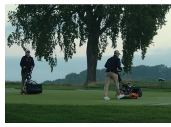
Proven quality of cut